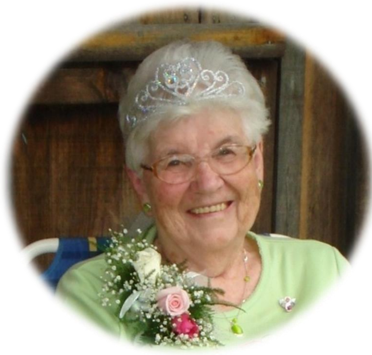
Mom at her 85 th Birthday Party, July 2009