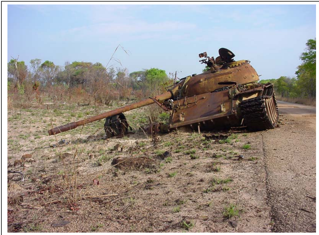
A Russian T54/55 battle tank lost in a minefield in the Okavango River Basin in Angola as evidence of the Cold War. The blood price paid for independence means that many African states jealously guard their sovereignty and resist supranationality.

This lack of popular support for supranational structures coincides with great importance placed on sovereignty by the newly formed states in the region. In many instances independence from colonial domination has been attained through a struggle for liberation, a memory indelibly etched on the world-view of those involved in governing such states. Sovereignty is seen as being important and is defended for fear of the consequences of giving it up. The popular resistance towards power being shifted away from the local level, in combination with the desire for sovereignty of the governing elites, precludes any meaningful absorption of individual states into a supranational structure. Thus what is required is not the replacement of the state by a larger supranational structure, but rather changes in the way actors within the state (at all levels from community to government) interact with their counterparts in neighbouring states.