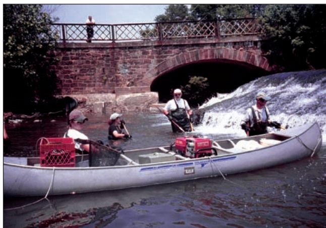
Figure 5. The effectiveness of dam removal as a method of river restoration is being evaluated in several regions of the US. (left) Scientists from Philadelphia's Patrick Center for Environmental Research study the removal of the 2-m high milldam on Manatawny Creek in southeast Pennsylvania in Aug 2002, (right) after documenting ecological conditions before the dam was removed (Bushaw-Newton et al. 2002).